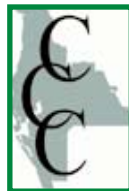
Chairs Coordinating Committee ccctransportation.org

Visit the CCC website at www.ccctransportation.org .